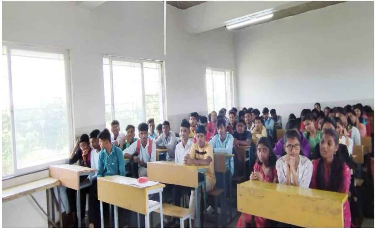
Dr.Babasaheb Ambedkar Mahaparinirvan Din Program Central Library Conducted