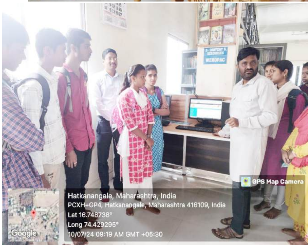
Students searching books with the OPAC Facility OPAC Facility Library orientation Program